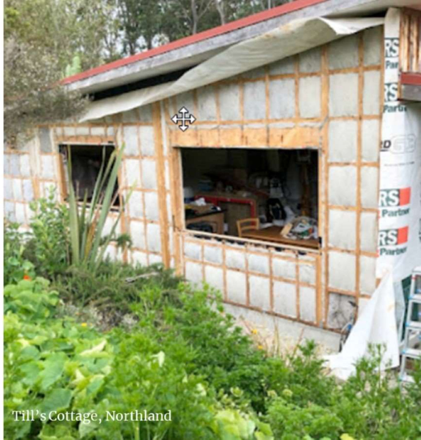
Till's Cottage, Northland